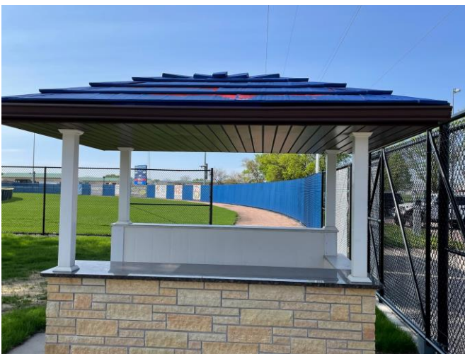
Media Check-in Kiosk