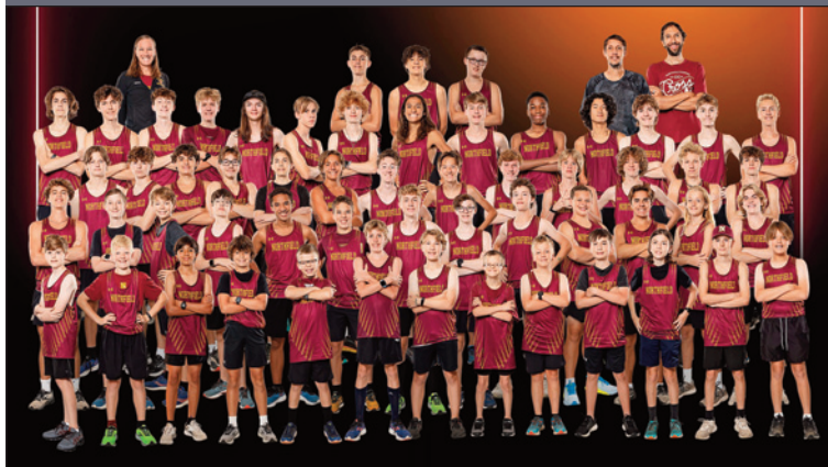
Section 1 Runner-Up – NORTHFIELD