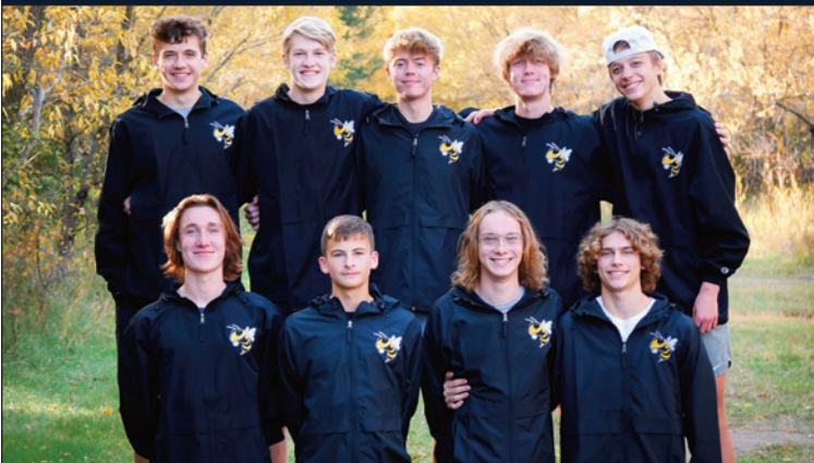
Section 8 Champion – PERHAM