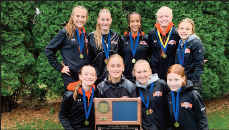
Section 1 Champion – FARMINGTON