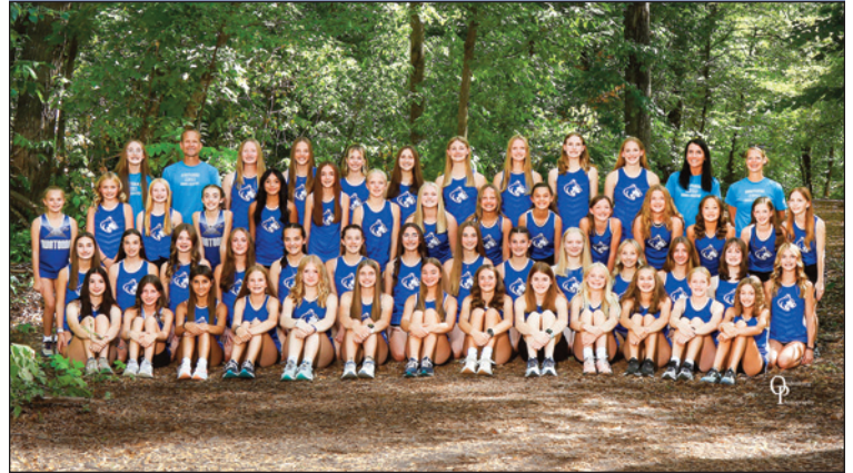
Section 1 Runner-Up – OWATONNA