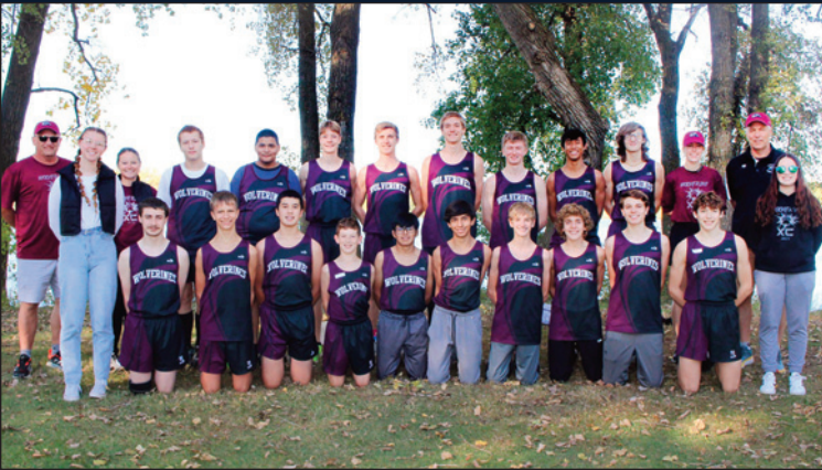
Section 2 Champion – *MOUNTAIN LAKE AREA/COMFREY