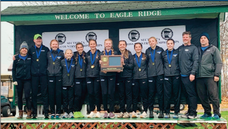
Section 7 Champion – *SOUTH RIDGE