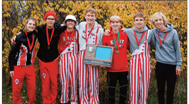
Section 7 Runner-Up – DULUTH EAST