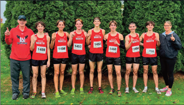
Section 1 Champion – LAKEVILLE NORTH