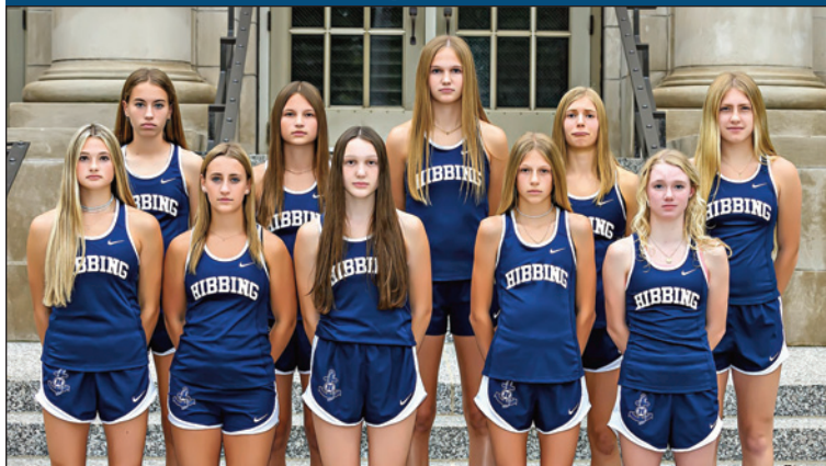
Section 7 Champion – *HIBBING