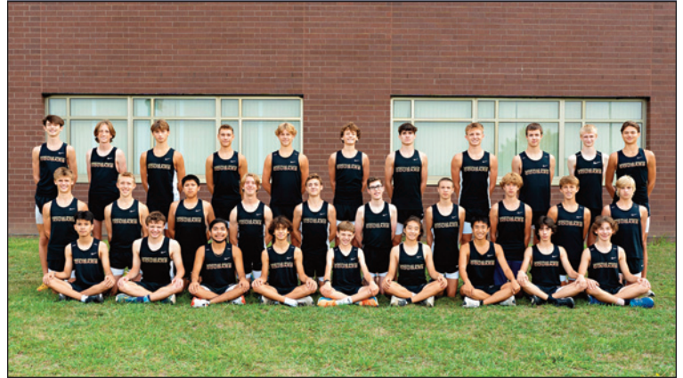
Section 1 Runner-Up – LAKEVILLE SOUTH