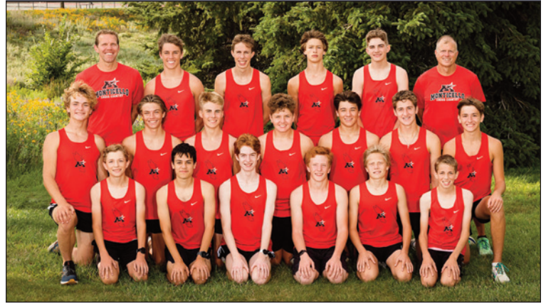
Section 5 Runner-Up – MONTICELLO