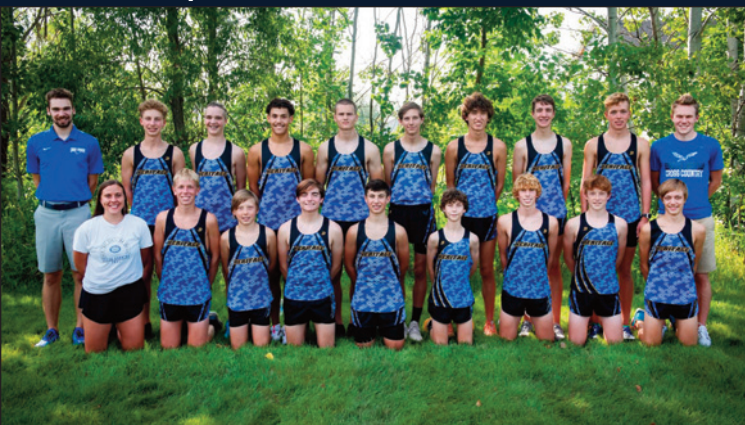
Section 4 Champion – *HERITAGE CHRISTIAN ACADEMY