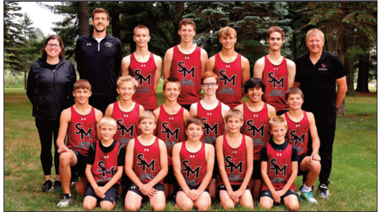
Section 6 Runner-Up – STAPLES-MOTLEY