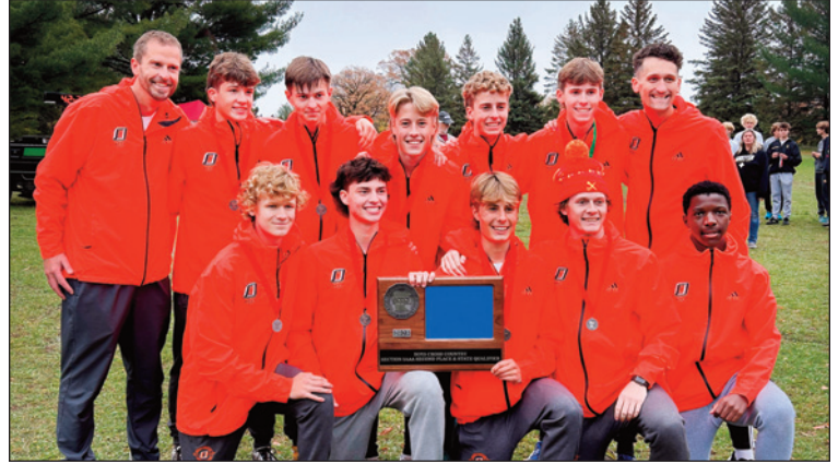
Section 5 Runner-Up – OSSEO