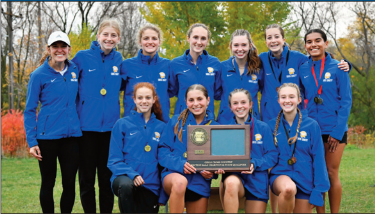
Section 6 Champion – WAYZATA