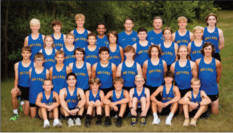
Section 5 Champion – BIG LAKE