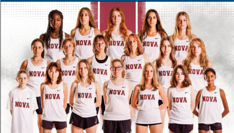
Section 4 Champion – *NOVA CLASSICAL ACADEMY