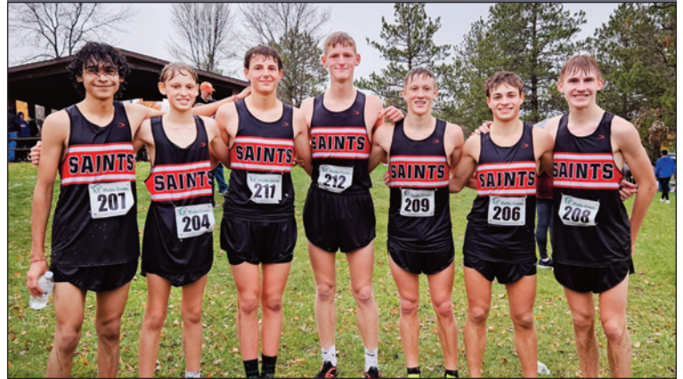
Section 2 Runner-Up – ST. JAMES