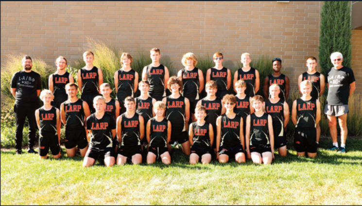
Section 1 Champion – *LEWISTON-ALTURA/RUSHFORD-PETERSON/HOUSTON