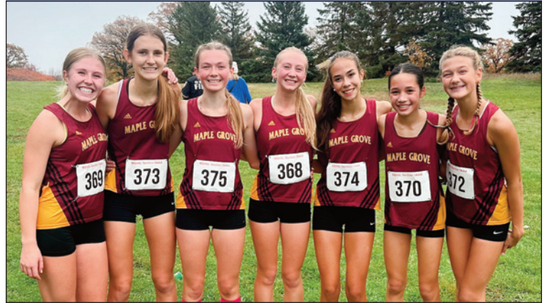
Section 5 Runner-Up – MAPLE GROVE