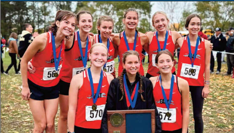
Section 7 Champion – DULUTH EAST