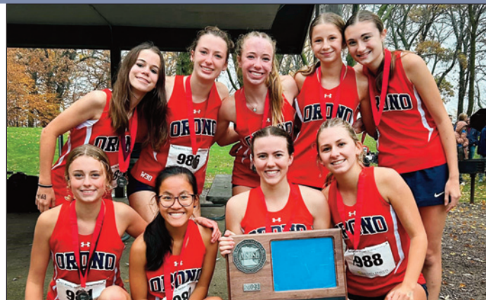
Section 6 Runner-Up – ORONO