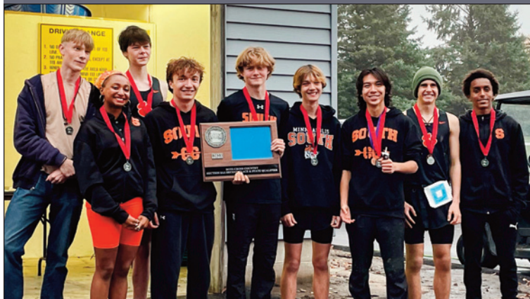
Section 3 Runner-Up – MINNEAPOLIS SOUTH