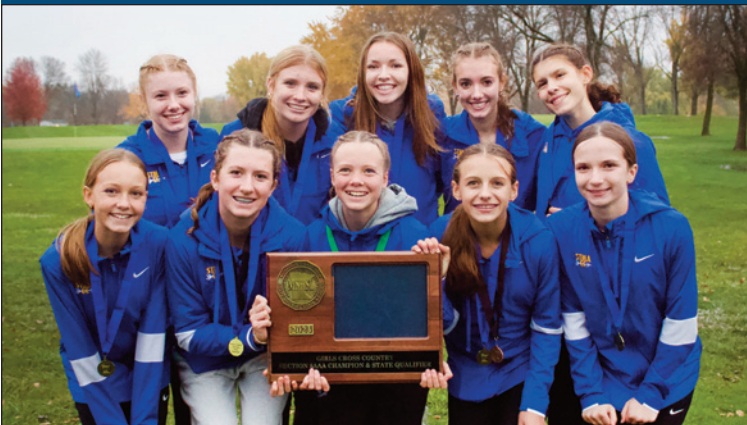
Section 8 Champion – ST. MICHAEL-ALBERTVILLE