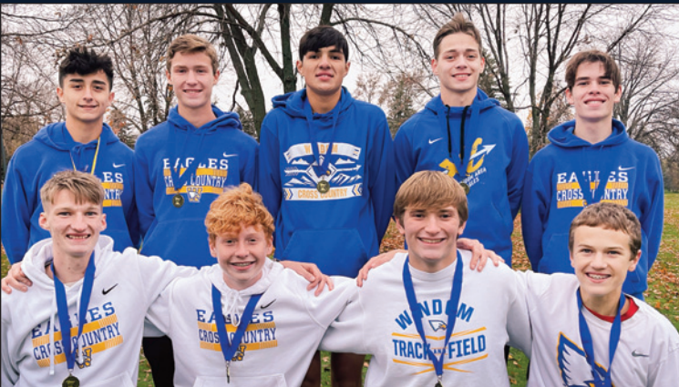
Section 3 Champion – WINDOM AREA