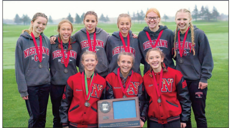
Section 5 Runner-Up – *NORTHWEST