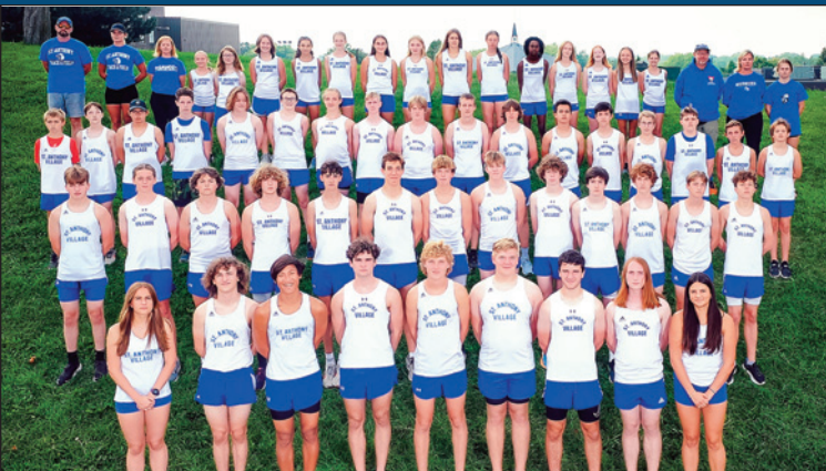
Section 4 Champion – ST. ANTHONY VILLAGE