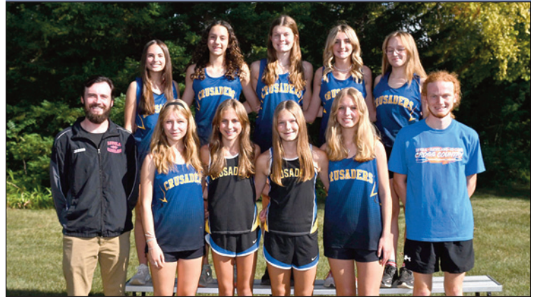
Section 2 Runner-Up – *LOYOLA/CLEVELAND/ST. CLAIR