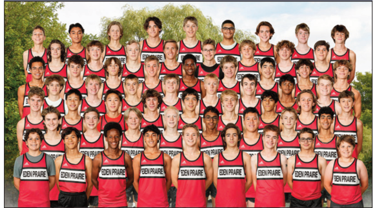
Section 2 Runner-Up – EDEN PRAIRIE