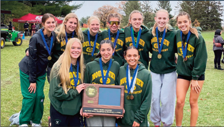
Section 5 Champion – MOUNDS VIEW