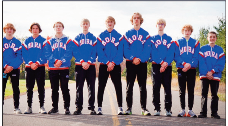
Section 7 Runner-Up – MORA