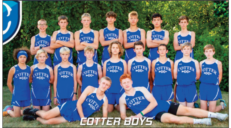
Section 1 Runner-Up – *COTTER