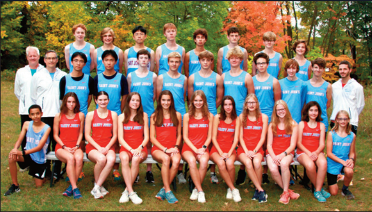
Section 5 Champion – ST. JOHN'S PREP