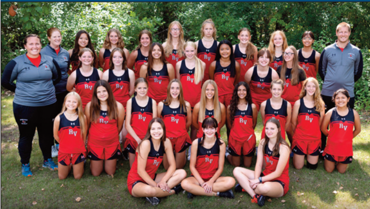
Section 3 Champion – REDWOOD VALLEY