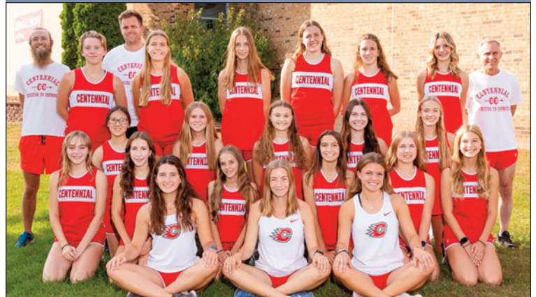
Section 7 Runner-Up – CENTENNIAL