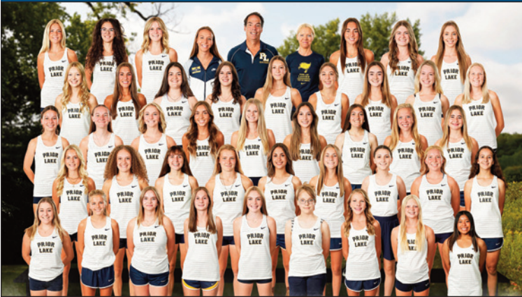
Section 2 Champion – PRIOR LAKE