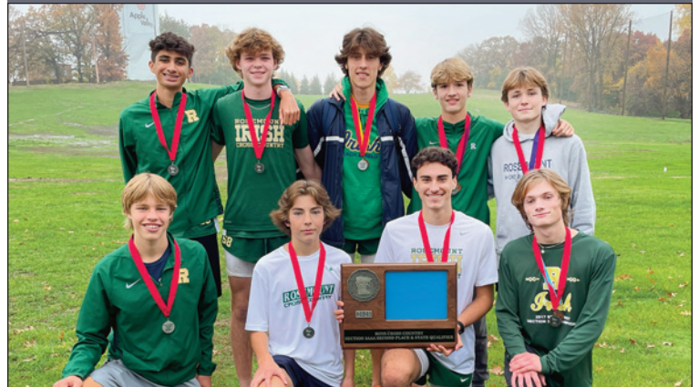
Section 3 Runner-Up – ROSEMOUNT