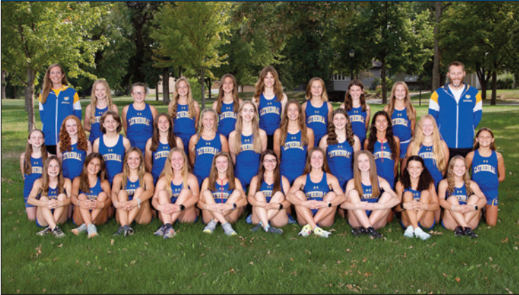
Section 5 Champion – ST. CLOUD CATHEDRAL