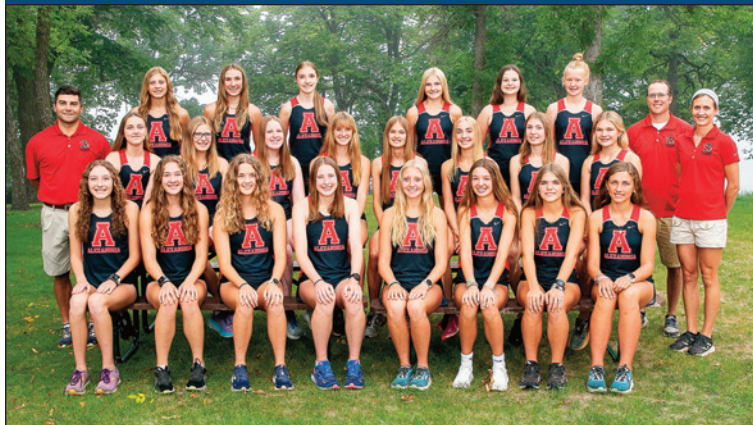
Section 8 Champion – ALEXANDRIA AREA