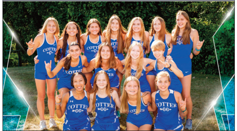
Section 1 Runner-Up – *COTTER