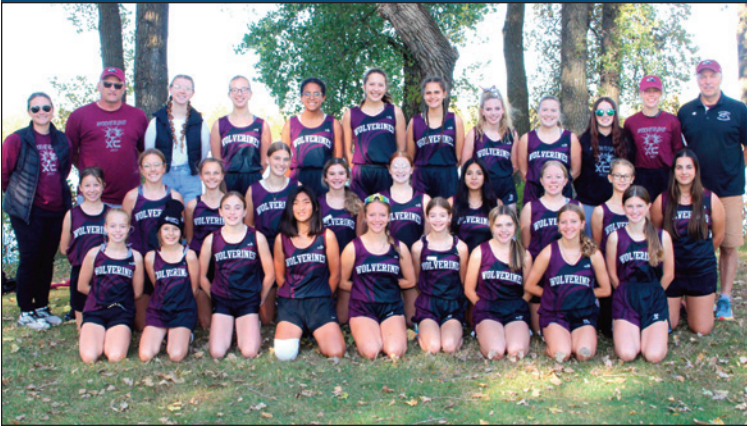
Section 2 Champion – *MOUNTAIN LAKE AREA/COMFREY