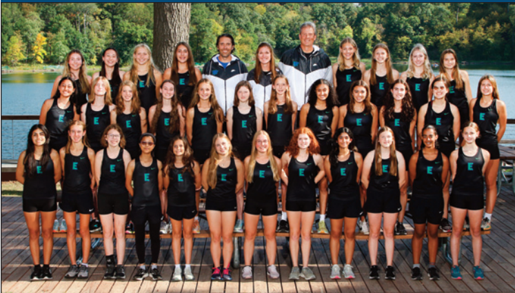
Section 3 Champion – EAGAN