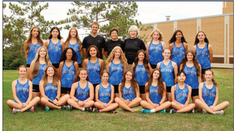
Section 3 Runner-Up – EASTVIEW