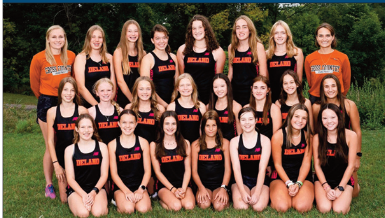
Section 6 Champion – DELANO