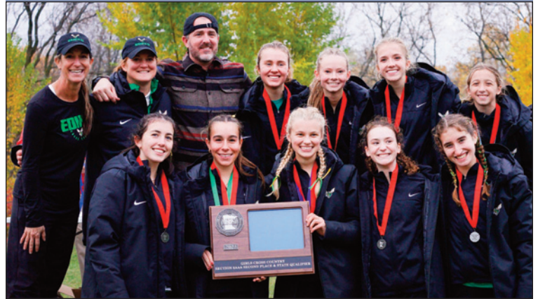
Section 6 Runner-Up – EDINA