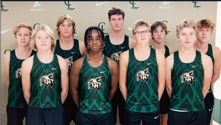
Section 7 Champion – CHISAGO LAKES