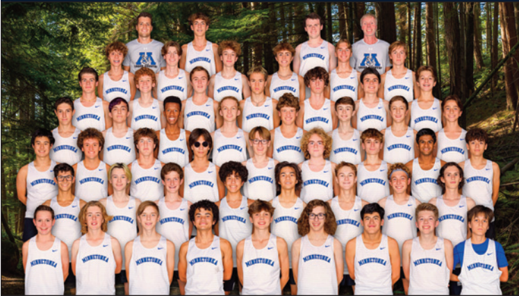
Section 2 Champion – MINNETONKA