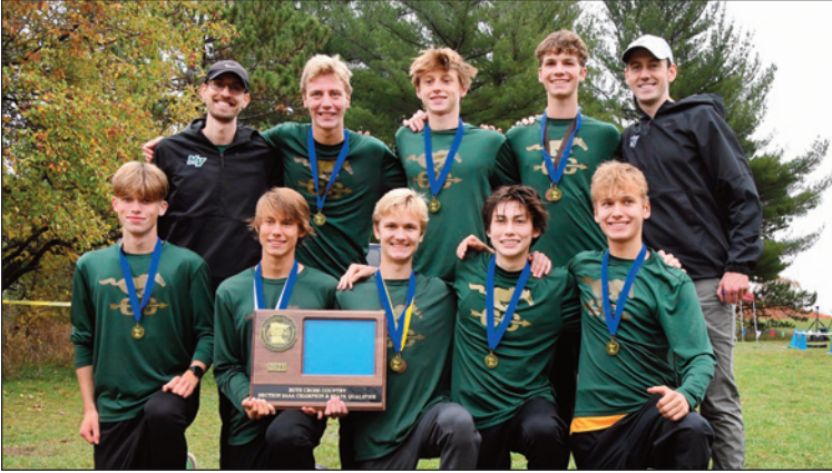
Section 5 Champion – MOUNDS VIEW