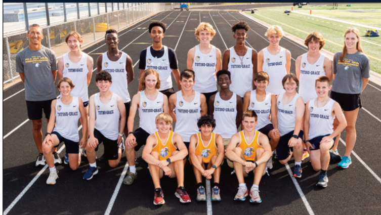
Section 4 Champion – TOTINO-GRACE