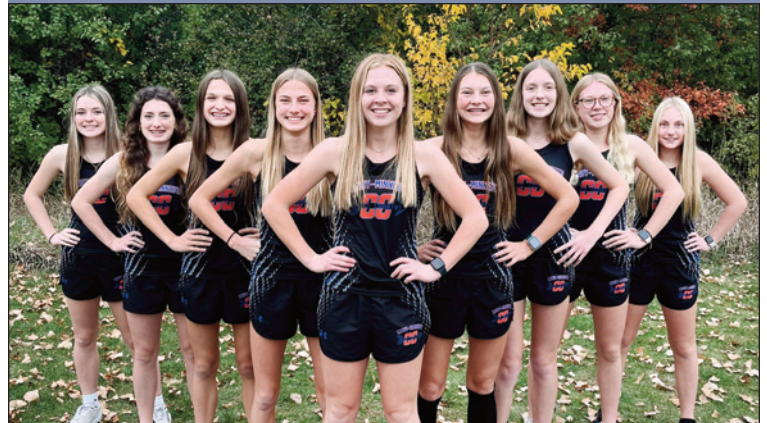
Section 3 Runner-Up – *CANBY/MINNEOTA