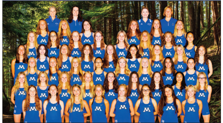
Section 2 Runner-Up – MINNETONKA