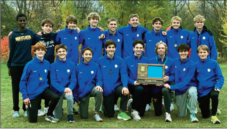
Section 6 Champion – WAYZATA