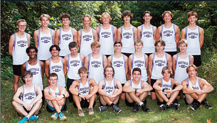
Section 8 Champion – BUFFALO