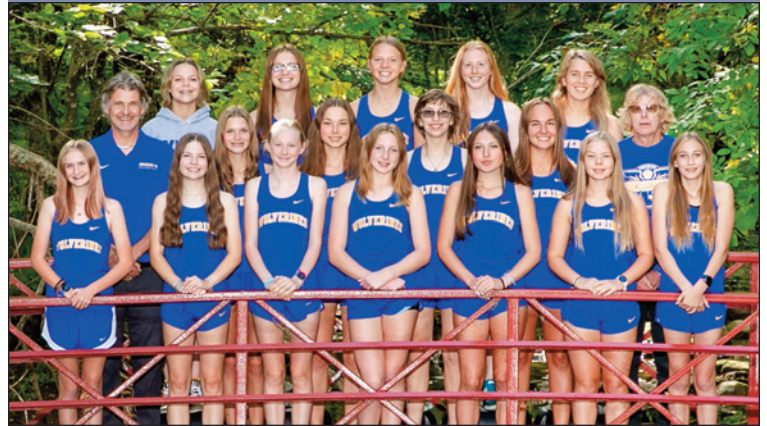
Section 6 Runner-Up – WADENA-DEER CREEK