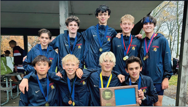
Section 6 Champion – ORONO