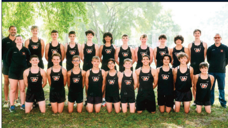
Section 1 Champion – WINONA