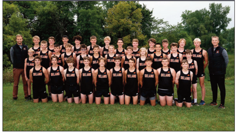
Section 6 Runner-Up – DELANO