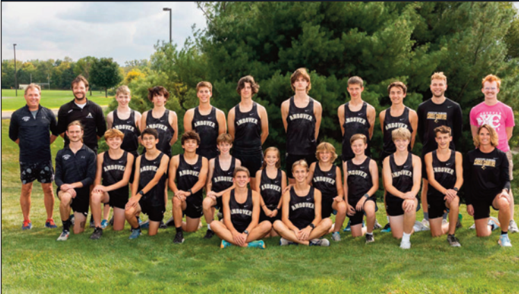
Section 7 Champion – ANDOVER