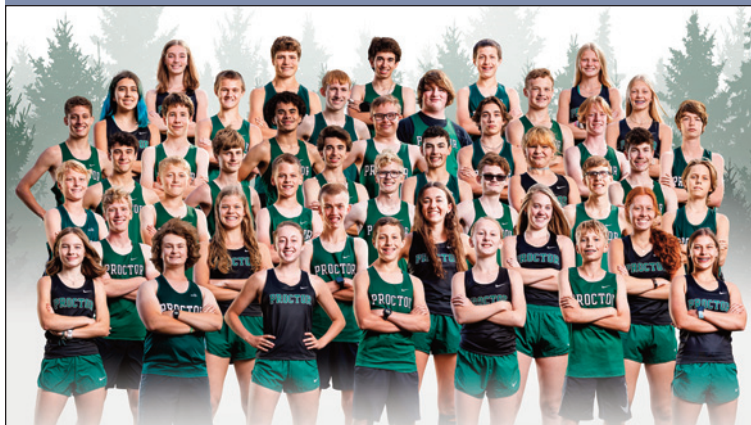
Section 7 Runner-Up – PROCTOR