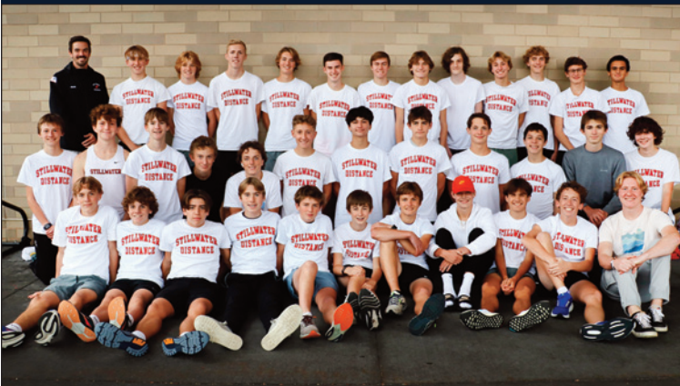
Section 4 Champion – STILLWATER AREA