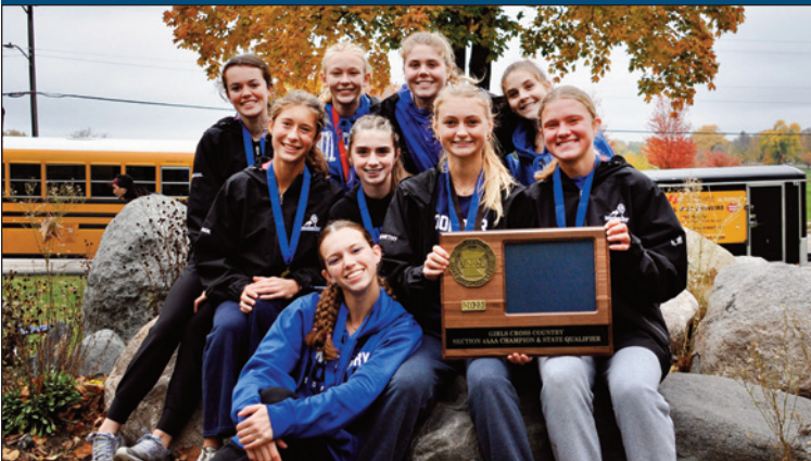
Section 4 Champion – WOODBURY