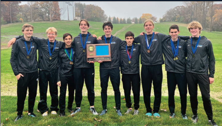
Section 3 Champion – BLOOMINGTON JEFFERSON