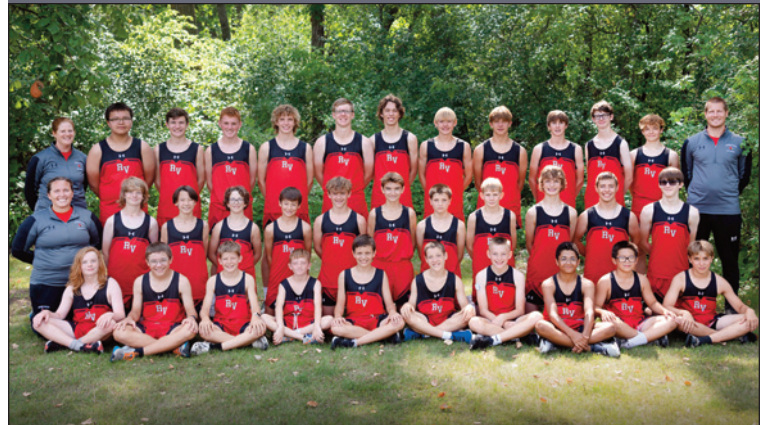
Section 3 Runner-Up – REDWOOD VALLEY