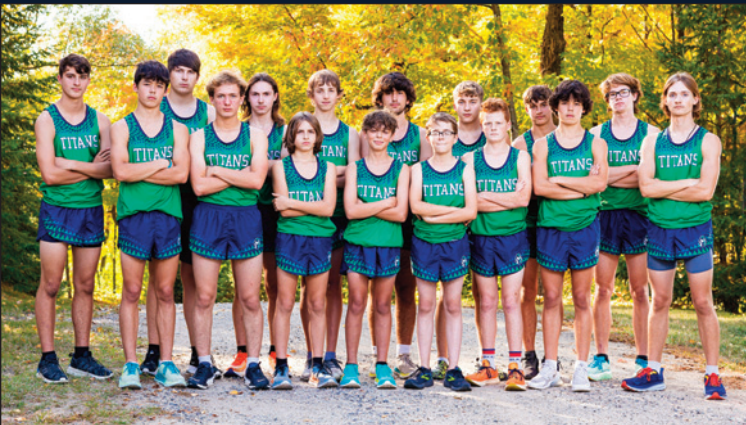
Section 7 Champion – *GREENWAY/NASHWAUK-KEEWATIN