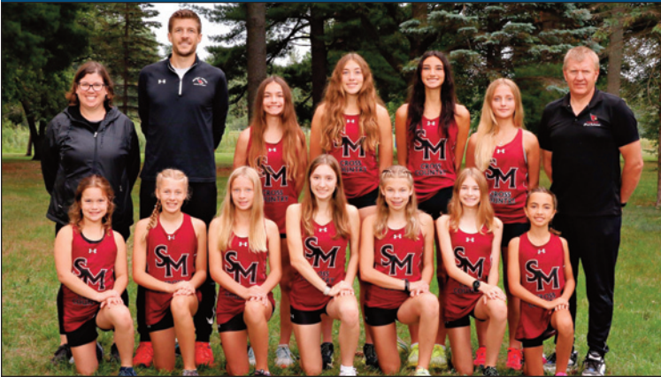
Section 6 Champion – STAPLES-MOTLEY