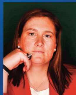
Lindsay Whalen ATHLETE Hutchinson

INDUCTION CEREMONY: Sunday, April 14, 2024